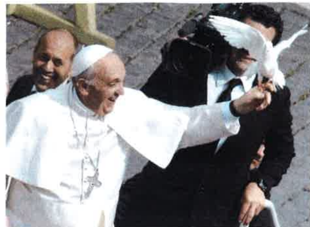
Pope Francis in St. Peter's Square

To reserve your place DEPOSIT $500 + $135 optional cancellation & travel insurance