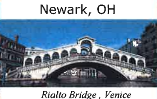
Rialto Bridge, Venice