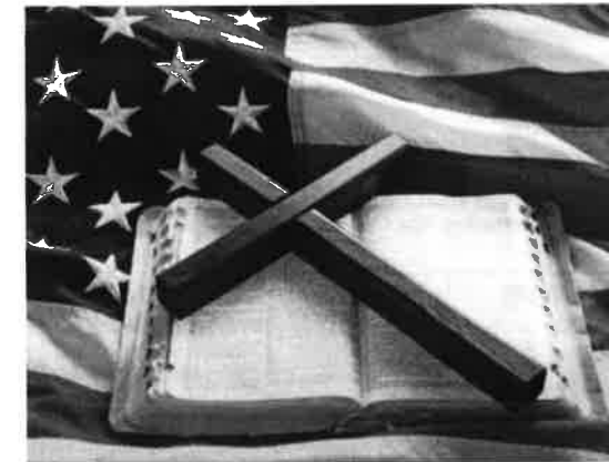
...Cue, Nation Under God...